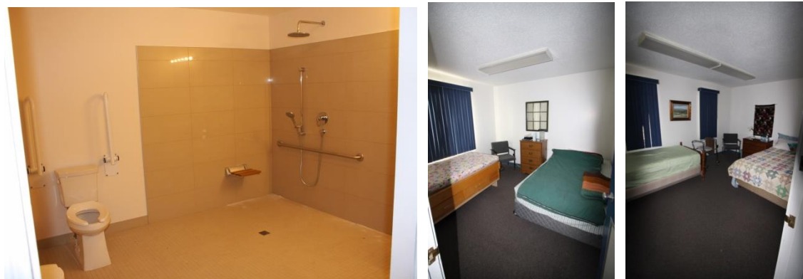
(Left to Right: Washroom with wheel-in shower, Bedroom # 2, Bedroom # 3)

Overnight Accommodation in Coyote Lodge: (Three bedrooms each with two beds; Cost including GST = $50 per bedroom per day):