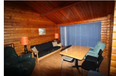
(Left to Right: Cabin #3 has 5 steps to deck and two internal steps, bedroom, living room)

Cabin #3 (six beds) has five steps to the deck and three steps from the foyer to the main floor. The larger bedroom has two captain's beds with two drawers each and one double bed. The smaller bedroom has two captain's beds. The living room has a dining table with hanging light & four chairs, one 6-pillow sofa, a leather Lazy boy chair, a bookcase, two end tables. There are two small washrooms, one with a sink and toilet, one with tub/shower and sink. Cost including GST = $75 per night for 1 to 4 persons. Cost for each additional person per night = $25.00. Children under two years of age are free. There is no reduced rate for children older than two years of age.