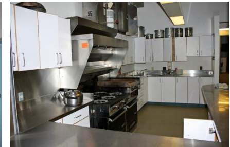
(Left to right: images of Coyote Lodge showing deck, dining room, kitchen)