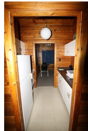
(Cabin #4 Left to Right: 7 steps to deck, living room, bedroom #3 with bathroom, kitchenette)